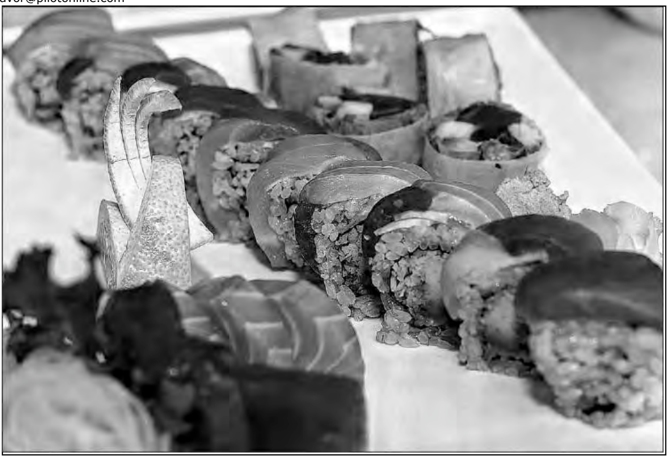
Menu items at Nara Sushi include New Wave Roll, top right (tuna, crab, cilantro and lettuce wrapped with rice paper); Oishii Roll, center (spicy crab, avocado with tuna and salmon on top with brown rice); and tuna and salmon sashimi, bottom left.